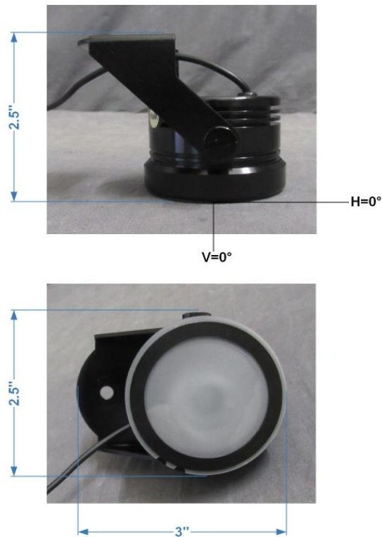
FIG. 1 LUMINAIRE